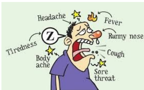
Not feeling well